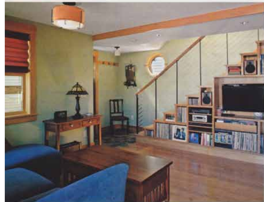
Clockwise: Architect Matt Hutchins designed this space-savvy staircase storage system especially to house his client's extensive album collection. The colorfully cute petite powder room. On the first floor is the main living space that is becomingly bright, and boasts radiant-heated bamboo hardwood flooring. Just off the living room, French doors lead out to a favored spot of the homeowners: a new front garden bearing a number of transplanted plantings from their original big garden.